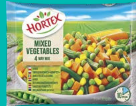
4 way mix 450 g

Ingredients: carrots, Mung bean sprouts, pepper, leek, onion, bamboo shoots, Mun mushrooms