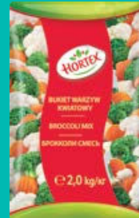
Broccoli mix Ingredients: carrot, cauliflower, broccoli