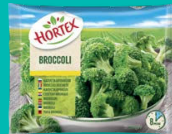
Broccoli 400 g