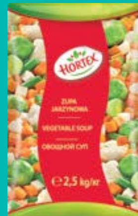
Vegetable soup Ingredients: carrots, cauliflower, green beans, Brussels sprouts, leek, celery