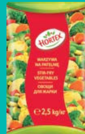
Stir-fry vegetables Ingredients: broccoli, roasted potatoes, carrots, pepper, string beans, onion, corn