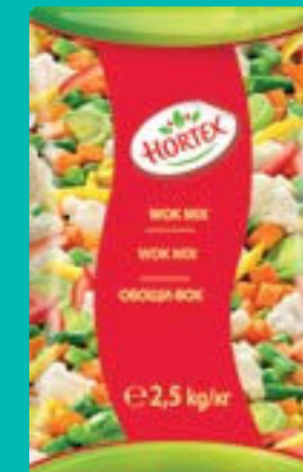
WOK mix Ingredients: carrots, string yellow beans, string beans, cauliflower, green peas, leek, celery, pepper, parsley