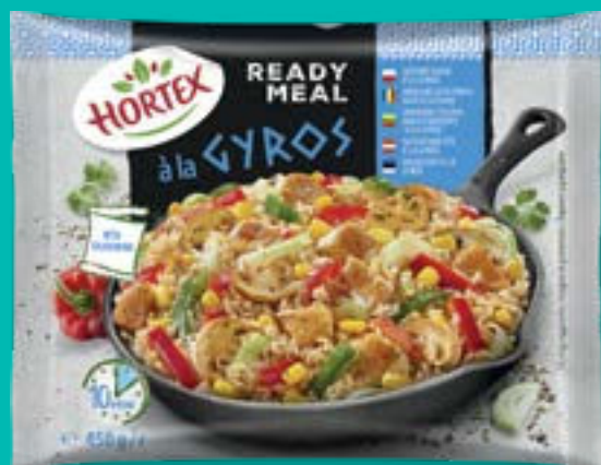
Gyros dish 450 g

Ingredients: rice, mushrooms, sweet corn, pepper, chicken, onion, herbal seasoning