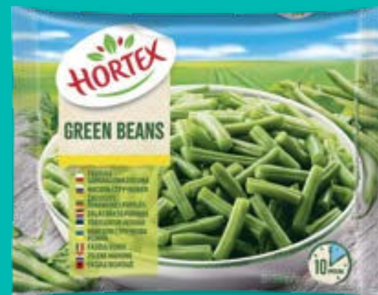
Green beans 400 g