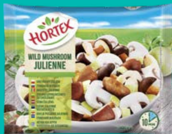
Wild mushroom Julienne 400 g

Ingredients: potatoes, bay bolete, carrot, onion, celery, parsley