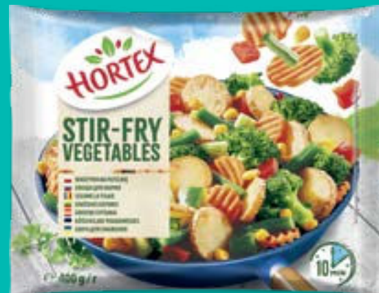
Stir-fry vegetables 400 g

Ingredients: broccoli, roasted potatoes, carrot, pepper, string beans, onion, corn