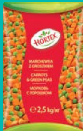
Carrots & green peas Ingredients: carrot, green peas