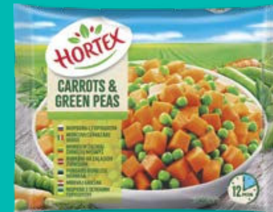
Carrots & green peas 400 g

Ingredients: carrots, string beans, pepper, broccoli, corn mini