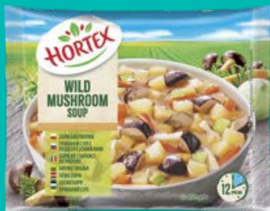
Wild mushroom soup 450 g

Ingredients: potatoes, bay bolete, carrot, onion, celery, parsley