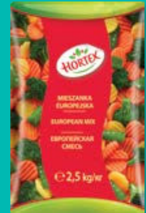
European mix Ingredients: carrots, broccoli, string beans