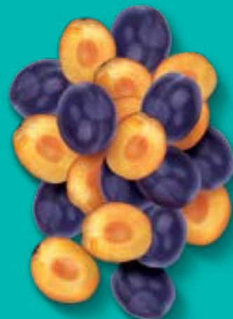
Plum 2,5 kg