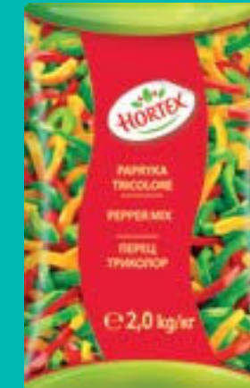
Pepper mix Ingredients: yellow pepper, green pepper, red pepper