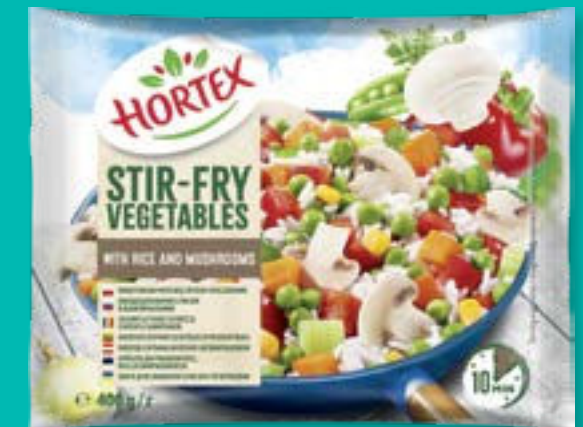
Stir-fry vegetables with rice and mushrooms 400 g

Ingredients: broccoli, carrots, corn, sugar peas (pods), celery, herbal seasoning