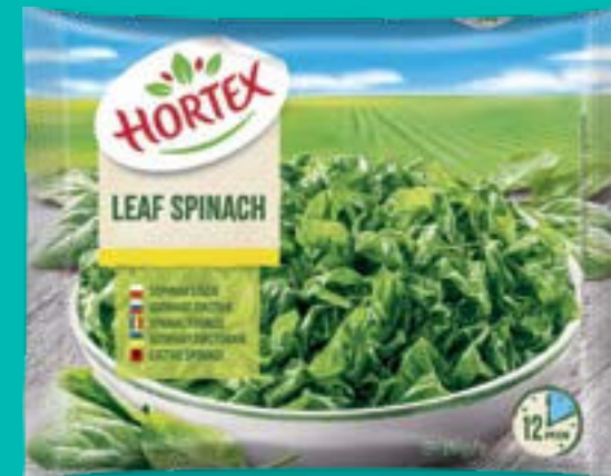
Leaf spinach 450 g