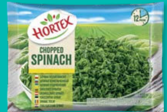
Chopped spinach 400 g