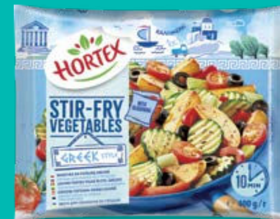
Greek style stir-fry vegetables with herbal seasoning 400 g

Ingredients: carrots, Mung bean sprouts, pepper, green peas, leek, sugar peas (pods), Mun mushrooms, herbal seasoning