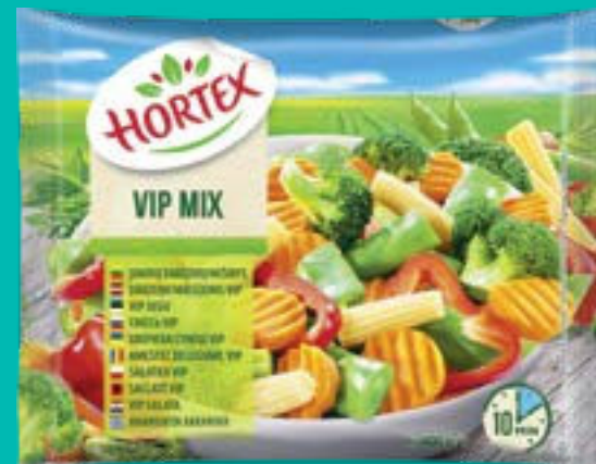
VIP mix 400 g

Ingredients: tomatoes, pepper, courgette, onion