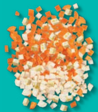
Soup mix cubes 2.5 kg