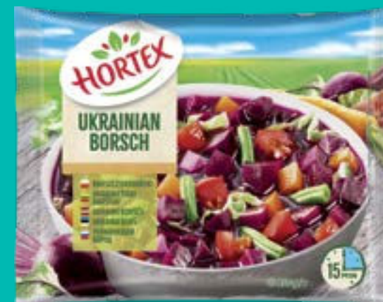
Ukrainian borsch 450 g Ingredients: beetroot, tomatoes, cabbage, carrots, string beans, celery