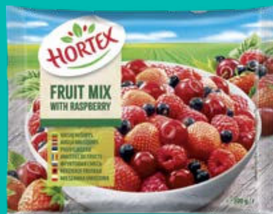
Fruit mix with raspberry 300g Ingredients: strawberries, blackcurrants, raspberries, cherries