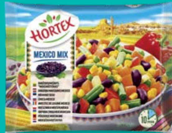
Mexico mix 400 g

Ingredients: carrots, pepper, string beans, green peas, corn, red beans, onion