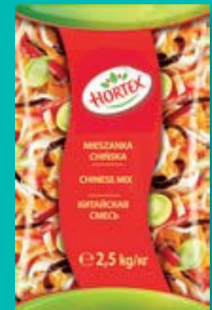
Chinese mix Ingredients: carrots, Mung bean sprouts, pepper, leek, onion, bamboo shoots, Mun mushrooms