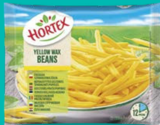
Yellow wax beans 400 g