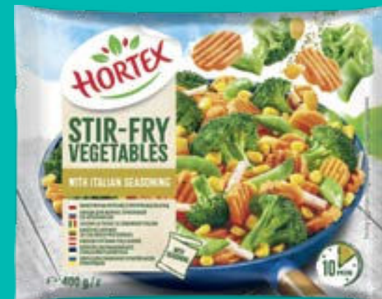
Stir-fry vegetables with Italian seasoning 400 g

Ingredients: roasted jacket potatoes, yellow string beans, courgette, corn, onion, pepper, herbal seasoning incl. pepper and mustard