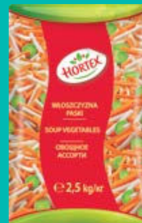
Soup vegetables Ingredients: carrot, parsley, celery, leek