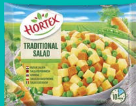
Traditional salad 400 g

Ingredients: cauliflower, string beans, carrots, Brussels sprouts, green peas