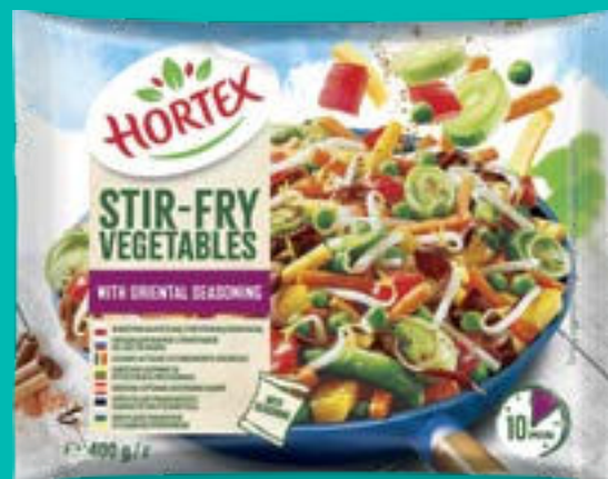
Stir-fry vegetables with oriental seasoning 400 g

Ingredients: green peas, rice, mushrooms, pepper, carrots, onion, corn