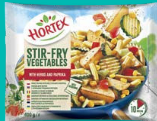
Stir-fry vegetables with herbs and red paprika 400 g

Ingredients: broccoli, roasted potatoes, carrot, pepper, string beans, onion, corn