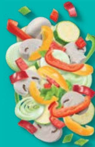
Grill vegetables 2,5 kg