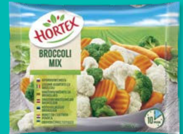
Broccoli mix 400 g

Ingredients: green beans, peas, carrot, sweet corn