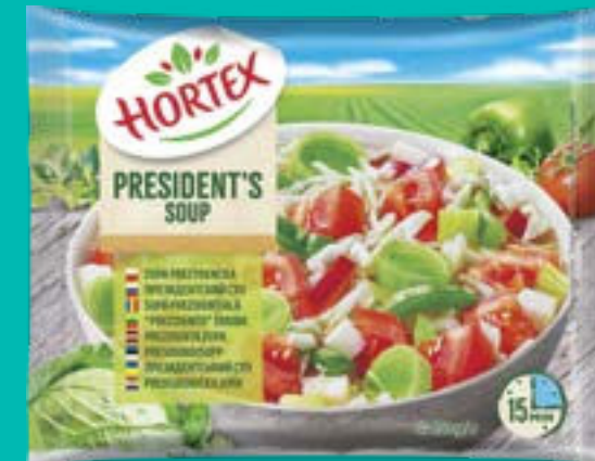
President's soup 450 g Ingredients: cabbage, tomatoes, celery, pepper, onion, leek