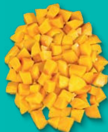
Mango cubes 1,5 kg