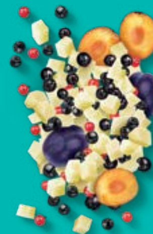
Fruit mix 2,5 kg