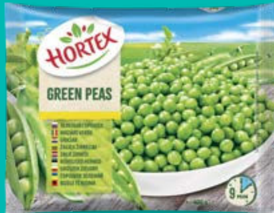
Green peas 400 g