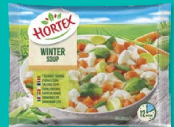
Winter soup 450 g Ingredients: carrots, cauliflower, string beans, Brussels sprouts, leek, celery