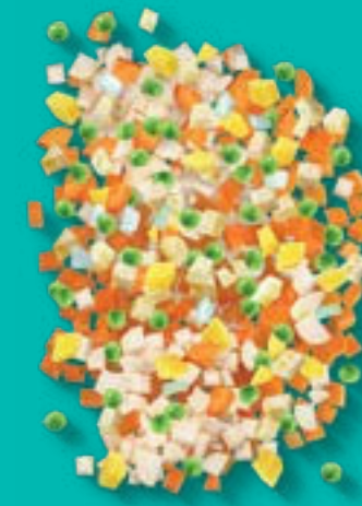
Vegetables salad 2.5 Kg