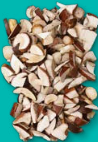
Julienne mushroom Mix 1,5 kg