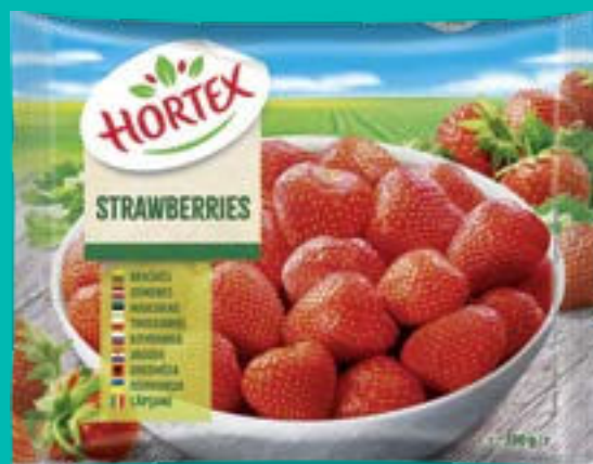
Strawberries 300 g