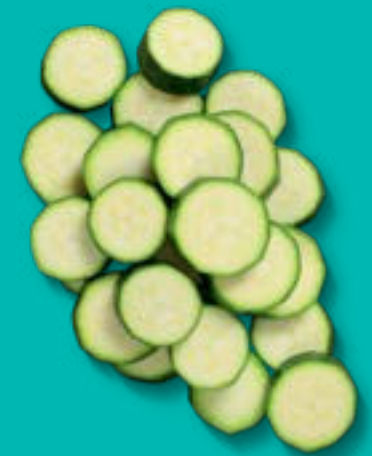
Zucchini slices 2,5 kg