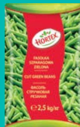
Cut green beans