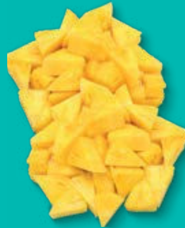
Pineapple 1,5 kg