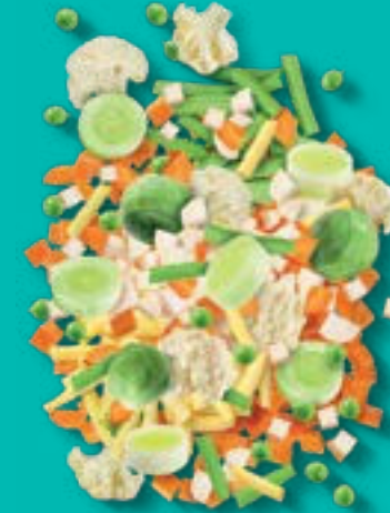
7-Ingredient mix 2,5 kg