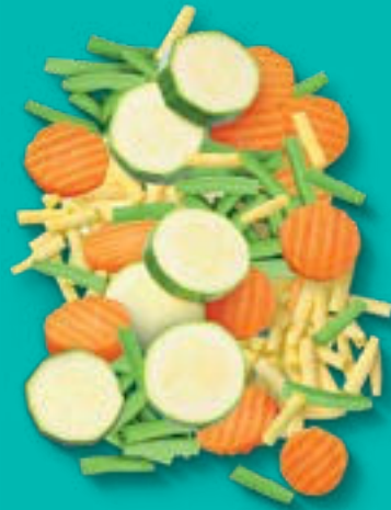
Dinner mix 2,5 kg