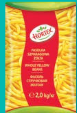
Whole yellow beans