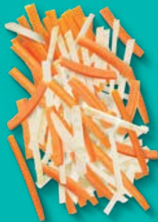
3-Ingredient soup Mix 2,5 kg