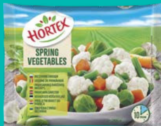
Spring vegetables 400 g

Ingredients: cauliflower, string beans, carrots, Brussels sprouts, green peas