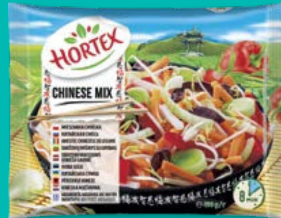
Chinese mix 400 g

Ingredients: carrots, pepper, string beans, green peas, corn, red beans, onion