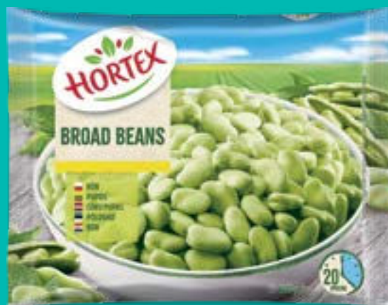
Broad beans 400 g