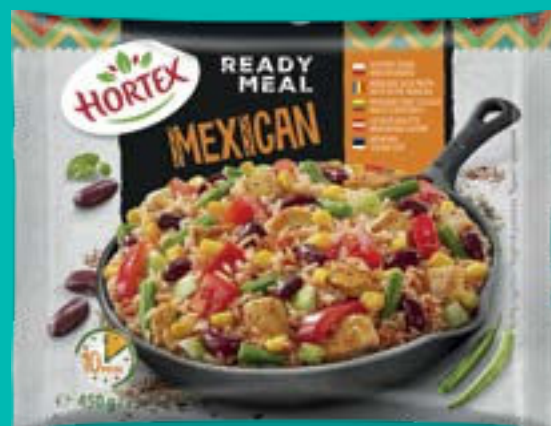
Mexican dish 450 g

Ingredients: rice, mushrooms, sweet corn, pepper, chicken, onion, herbal seasoning