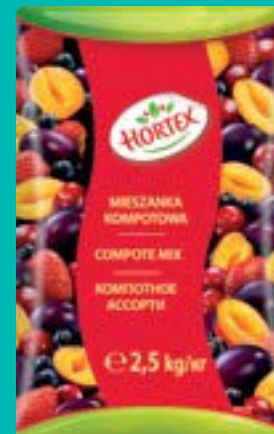
Compote mix Ingredients: stoned plums, stoned cherries, strawberries, blackcurrants