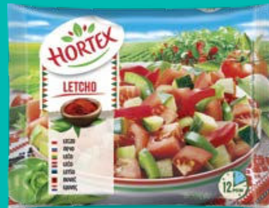
Letcho 400 g

Ingredients: carrots, cauliflower, broccoli