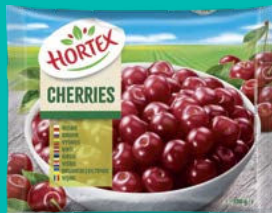
Stoned cherries 300 g